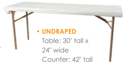
Table: 30" tall x 24" wide Counter: 42" tall x 24" wide